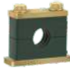
Hydraulic Pipe Clamps