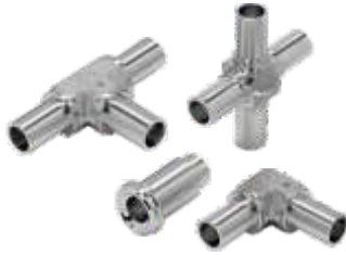
Orbital Weld Fittings