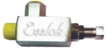
Float Valve & Safety Valve