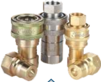
Quick Release Coupling