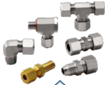
Hydraulic Tube Fittings